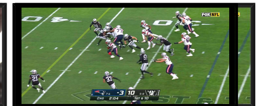
16:9 Content (full mode)

Note: 8% of content is cropped at the top and bottom. If subtitles are still missing, use the 16:9 content settings.