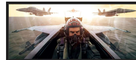
2.4:1 Movies and Streaming

10. GET FAMILIAR WITH PROJECTOR SETTINGS.