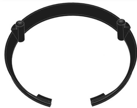
Retainer nested into projector lens opening